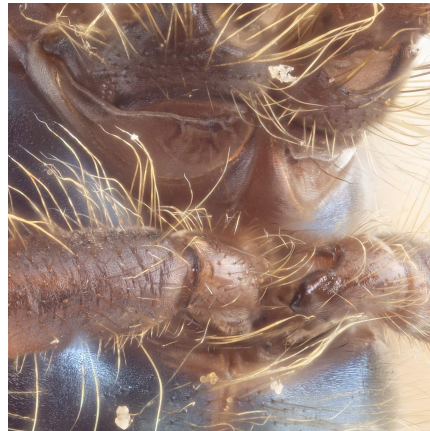
Lapposyrphus lapponicus metasternum