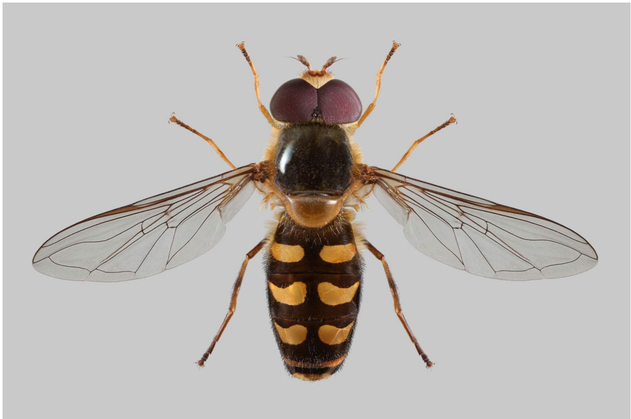
Lapposyrphus lapponicus habitus male