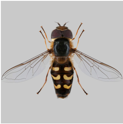
Scaeva selenitica male habitus