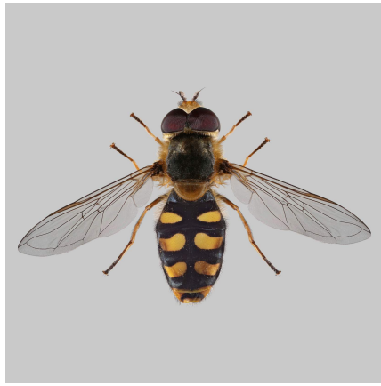
Eupeodes luniger male habitus