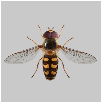
Lapposyrphus lapponicus male habitus

apex of tergite 5. This sulcus is black haired including on any margins of the tergites that are yellow which is the same as in the related genera Eupeodes and Scaeva and in contrast to most of the other genera of Syrphini, e.g. Syrphus , Epistrophe and Parasyrphus . The wing membrane outside of vein M_1 and crossvein dm-m is broad and usually slightly undulating which is also similar to the related genera Scaeva , Eupeodes and Ischiodon . Superficially, specimens of Lapposyrphus are particularly similar to a species of Eupeodes which have a pair of yellow bars on tergites 3 and 4 separated by black in the midline and with the lateral margins of tergite 5 black. However, in contrast to all Eupeodes species, Lapposyrphus has a bare metasternum and the vein R_{4+5} is strongly curved with its hypothetical tangent at the inflection point clearly intersecting vein R_{2+3} . The bare metasternum and strongly curved vein R_{4+5} are also found in the genus Scaeva but, in contrast to this genus, Lapposyrphus has bare eyes with a narrow (less than 90^\circ ) angle of approximation of the eyes.