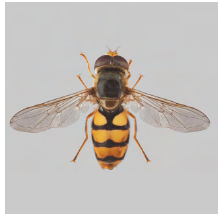
Eupeodes nuba male habitus