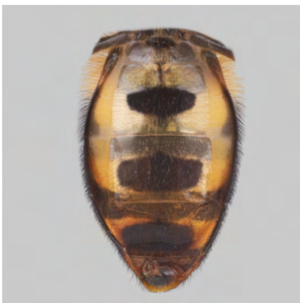
Eupeodes lucasi male sternites

The extent of yellow markings on the abdomen is highly variable within a particular species. It is influenced by temperature during pupal development (Dušek et Láska 1974). In dark specimens from cold conditions the yellow markings are reduced and, in extreme cases, may be absent altogether. The tergites and the sternites may also be almost entirely black.