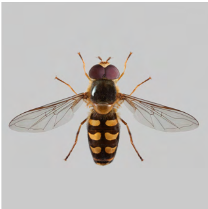
Lapposyrphus lapponicus male habitus

The genus Eupeodes comprises rather robust average sized hoverflies with virtually bare eyes, a shiny or subshiny thorax and a black oval abdomen with more or less extensive transverse yellow markings. The abdomen is flattened with a very distinct marginal sulcus covered only with black hairs including on any margins of the tergites that are yellow. Tergites 3 and 4 are black in ground colour each with a pair of yellow more or less undulated bars or a straight, wavy or emarginate band. The wing membrane outside of vein M_1 and crossvein dm-m is broad and usually slightly undulating which is similar to the related genera Scaeva and Lapposyrphus but all Eupeodes species have the R_{4+5} only slightly curved and the metasternum hairs unlike the other genera.