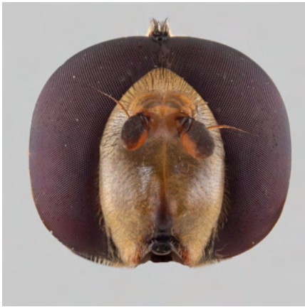
Eupeodes lucasi male