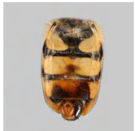
Eupeodes corollae male sternites