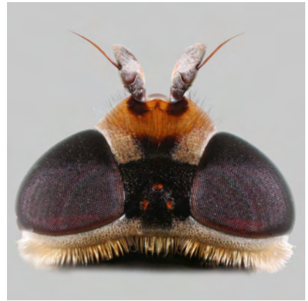
Eupeodes luniger female