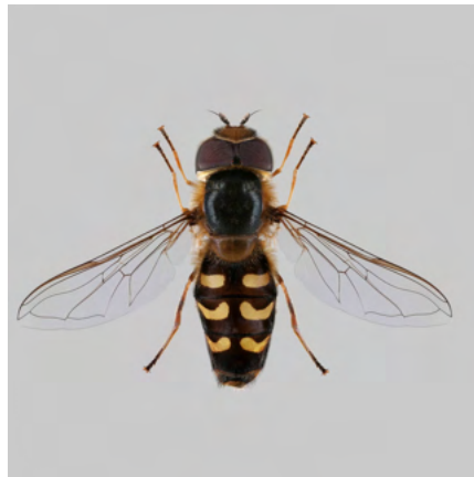
Scaeva selenitica male habitus