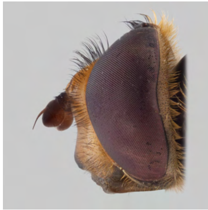
Eupeodes curtus male