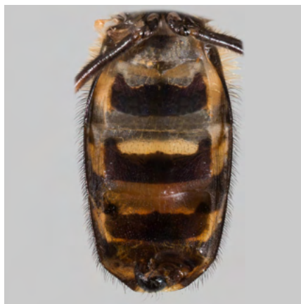
Eupeodes nitens male sternites