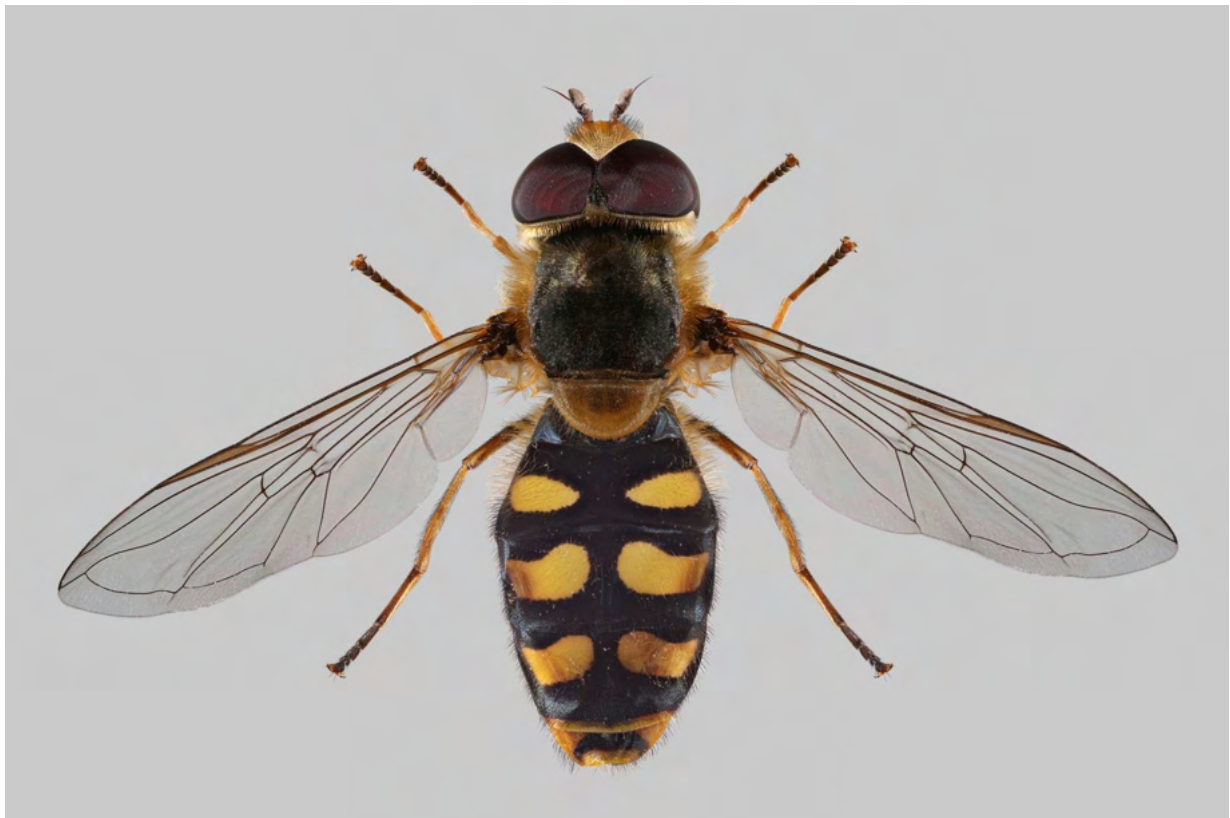
Eupeodes luniger male habitus