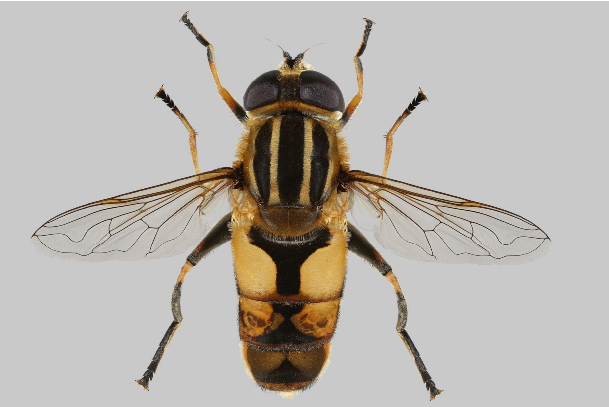
Helophilus hybridus male