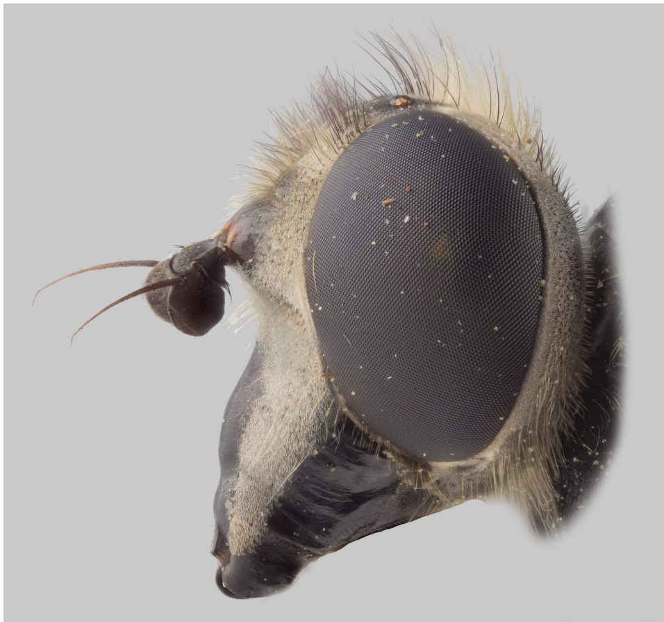
Arctosyrphus willingii female