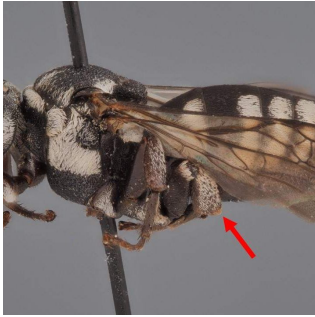
(a) Triepeolus tristis Female