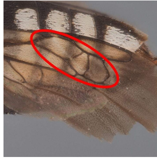
(b) Triepeolus tristis Female