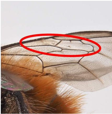
(a) Osmia cornuta Male