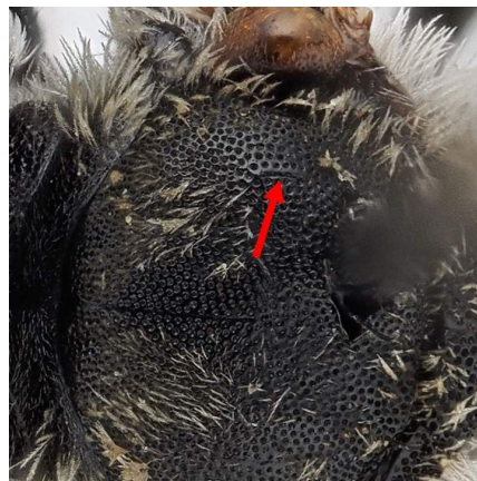
(e) Osmia andreoides Female