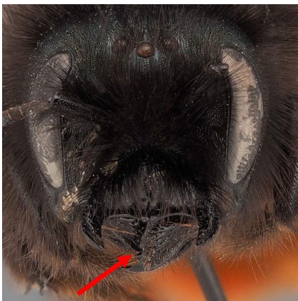
(d) Osmia cornuta Female