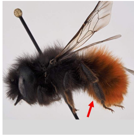
(b) Osmia cornuta Female