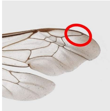
(b) Nomada emarginata Male