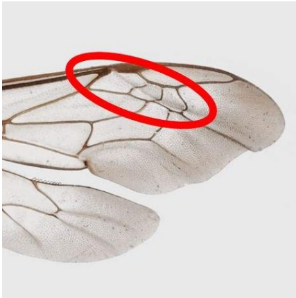
(a) Nomada emarginata Male