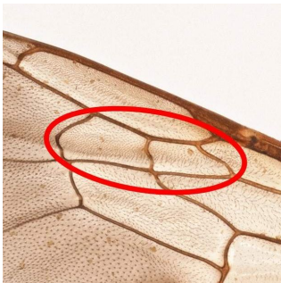
(a) Melitturga caudata Female