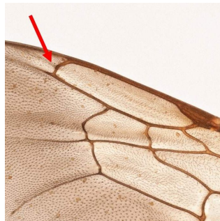
(b) Melitturga caudata Female