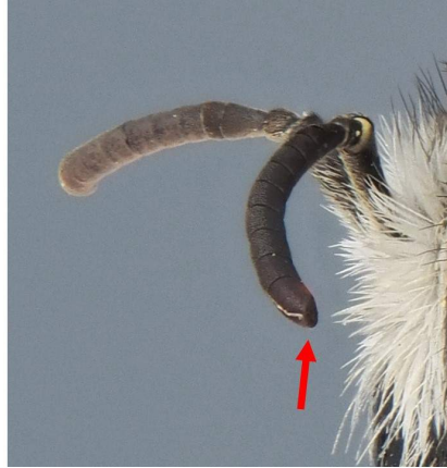
(b) Melitta hispanica Female