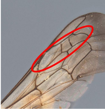
(a) Melitta hispanica Female