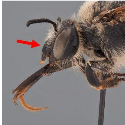
(b) Eucera longicornis Female