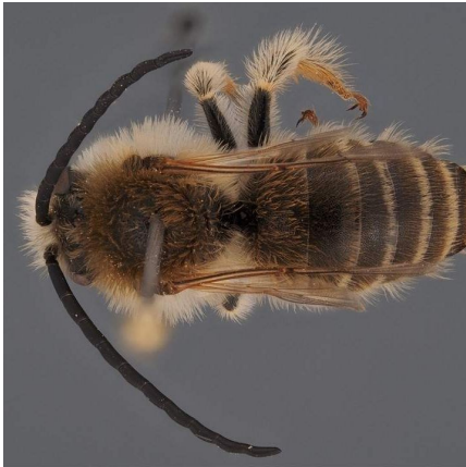
(a) Eucera nigrifacies Male