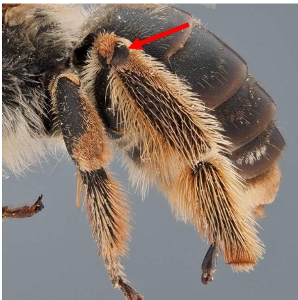
(d) Eucera longicornis Female