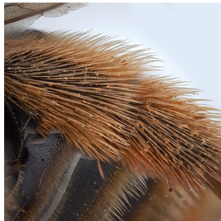
(e) Eucera alternans Female