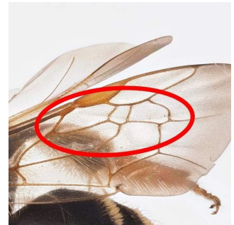
(d) Andrena falsifica Female