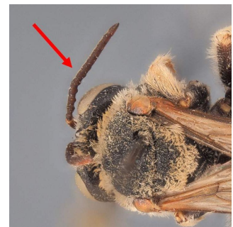
(d) Ancyla holtzi Male