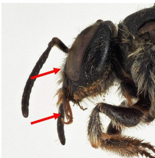
(a) Ancyla nigricornis Female