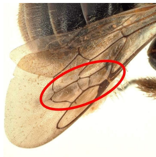
(b) Ancyla nigricornis Female